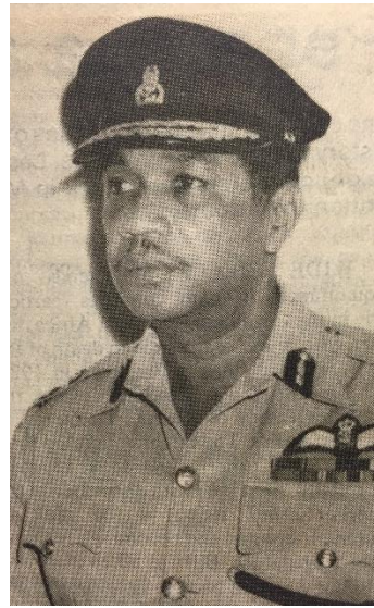
Fig. 11. Commissioner L.W. Leigh 39

http://webapp1.dlib.indiana.edu/images/item.htm?id=http://purl.dlib.indiana.edu/iudl/lcp/tubman/VAA7927-4533&scope=$scopeId .