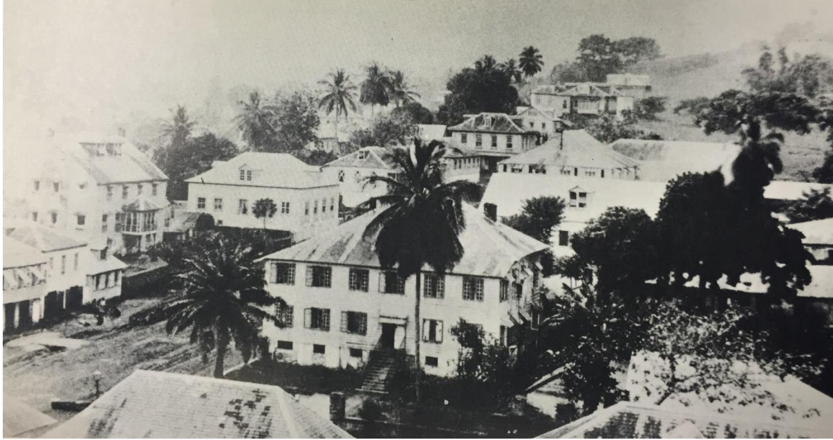
Fig. 3. Horton Hall, Gloucester Street, Freetown, Sierra Leone (house with the bay window and portico, second from left) 30